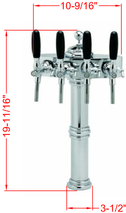
Model Shown PE-4 -IMP-SS

Perfection Equipment, Inc. Perfecta Stainless Division