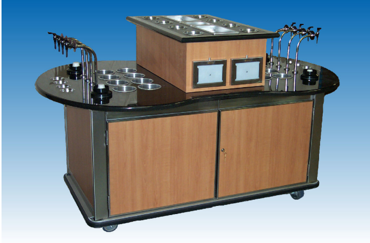
(SHOWN) CUSTOM LAMINATED STAINLESS STEEL CART WITH GRANITE TOP

Perfection Equipment, Inc. Perfecta Stainless Division